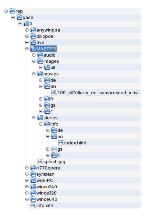
Figure 3: The content repository structure.

one or more master Transcoding Multimedia Caches (TMCs) run on the network and have direct access to the content repository via HTTP. On the consumer devices, a client media cache is implemented, which uses the local memory card as cache storage.