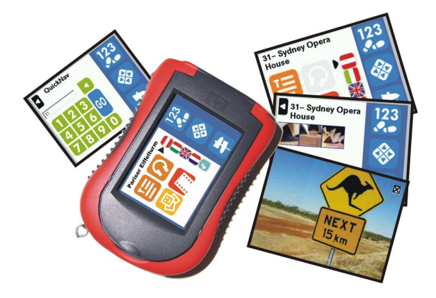
Figure 2: The rentable M3-Guide with screen shots.

about the actual usage of the guides are also available, monthly summarized statistics may be sent via email.